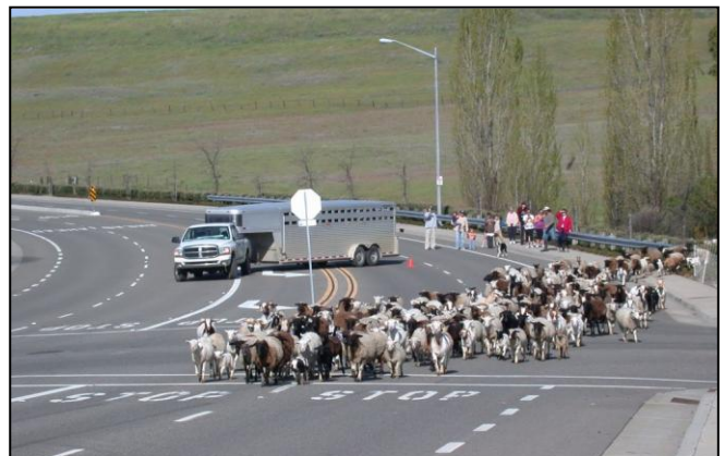
Residents gather to watch the goats and sheep being herded down Park Drive in 2010.

Last year, the resounding feedback from residents about the grazing was that everyone enjoyed watching the goats and sheep and considered the "entertainment value" for themselves, their children and/or their grandchildren an "added value" and "priceless". We hope you enjoy!